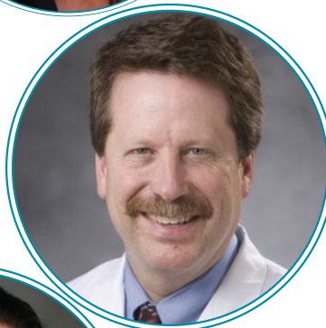
Robert Califf, MD CTTI Co-Chair Vice Chancellor for Clinical Research of Duke University